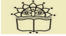
Vidya Pratishthan's English Medium School, Bilt.